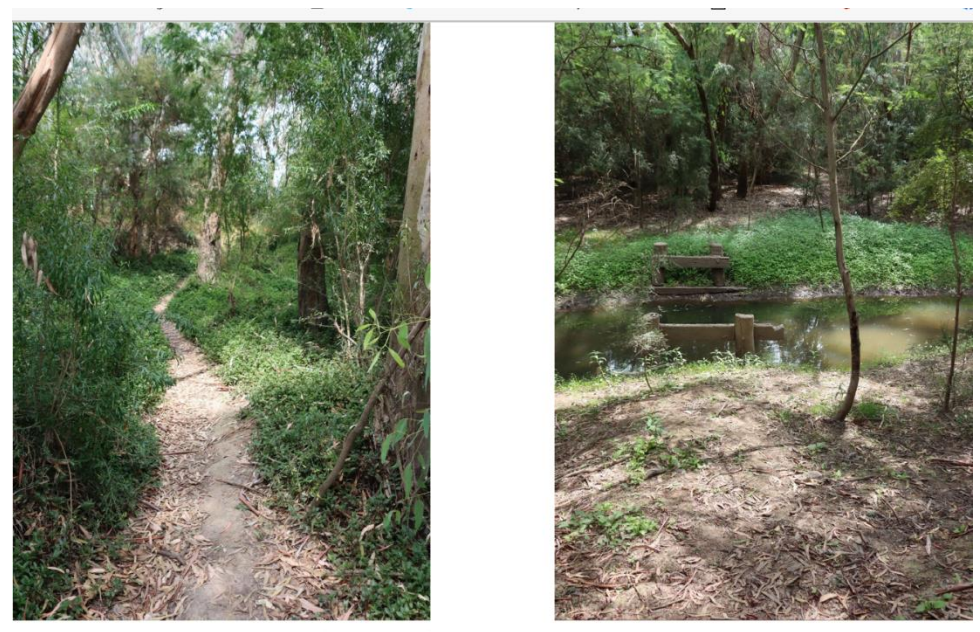
"Shared Use Trail" through the Little Bolin Billabong area

Connections and linkages to Birrarung from the cultural wetlands would be impossible with the trail in its current condition.